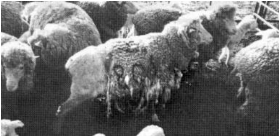
Figure 5.2. An example of partial shedding of the fleece resulting from acute stress. The remainder of the fleece is extremely weak and can be easily removed by hand.

In each instance, a reduction in wool growth rate arises, causing a reduction in the total amount of wool that is ultimately produced as well as an accompanying reduction in fibre diameter. In addition, sustained high levels of cortisol can cause partial to complete cessation of follicle activity, creating a definite break in the wool and lowering staple strength (Figure 5.2).